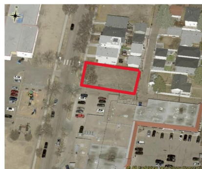
9115 143 St-Location