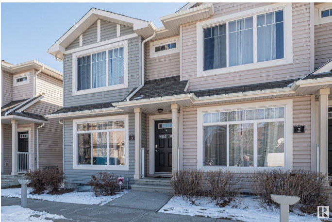
3-6032 38 Ave NW, Edmonton, AB

Main Floor Exterior Area 487.63 sq ft Interior Area 437.16 sq ft